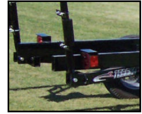
Tie Downs Front And Back