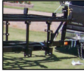
Sturdy Cross Brace With Nylon Bushings (Standard Models Only)